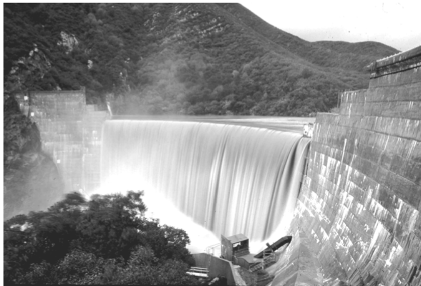
Figure 5: Matilija Dam spilling during a 5-year storm, March 2001.

Matilija Dam has never provided any flood control capacity, and its purpose for water supply diminished significantly with the construction of a primary domestic water supply at Casitas reservoir in 1954. Then, in 1965, only 13 years after the reservoir first filled with water, structural concerns led to the removal of a 35-foot notch to reduce the dam's capacity. As shown in Figure 5, even small floods overtop the structure. The dam is obsolete, ineffective for flood control, and has limited value for water supply (ACOE, 2002).