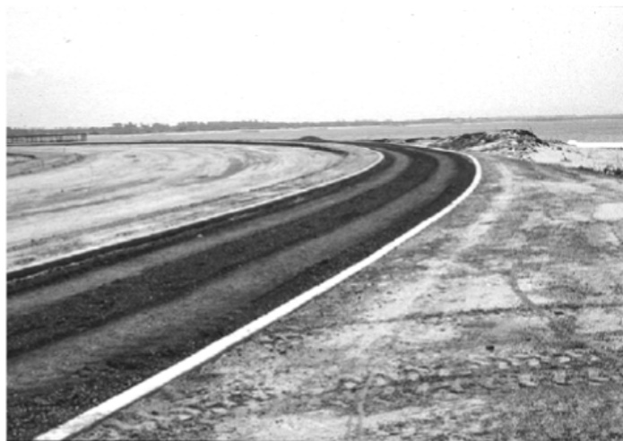
Figure 2: Construction of the Surfers Point parking lot and bike path, 1989.

Statewide, this infrastructure has in many cases been damaged by coastal erosion, often as a result of poor coastal planning leading to inadequate setbacks from a dynamic shoreline. Because one of the primary mandates of the California Coastal Act is to provide for public access, concessions are often made to provide public infrastructure without full consideration of the long-term impacts to placing such facilities in a hazard-prone area. The situation near the mouth of the Ventura River is certainly an example of this.