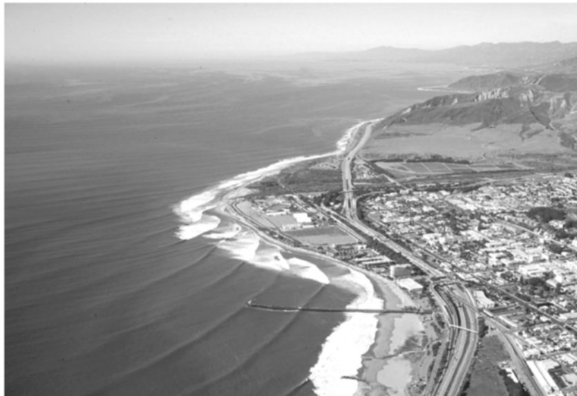
Figure 1: Ventura River delta, November 1999.

In 1997, the southern steelhead trout was added to the federal list of endangered species. The Endangered Species Act requires that recovery actions be taken to achieve the goal of de-listing the species. (FINNEY and EDMONDSON, 2001) As a result, the fisheries issue has been the driving force behind many of the existing watershed-based planning and restoration efforts in the state.