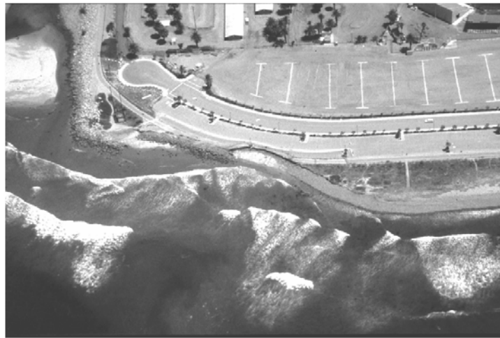
Figure 3: Parking lot and bike path near the mouth of the Ventura River, 1995.

In 1989, a bike path and parking lot were constructed on artificial fill placed adjacent to the beach. As Figure 2 shows, these facilities were placed within the oceanfront corridor at Surfers Point and encroached upon a remnant dune formation. The increased public access soon led to the destruction of the dune resource (CAPELLI, 1991) This development was approved through an amendment to the Local Coastal Plan (LCP) in order to provide for “public uses and development, including a public roadway, walkways, bikeways, parking and other infrastructure incident to public access and recreation” within the 250-foot setback designated as the “oceanfront corridor” (CITY OF SAN BUENAVENTURA, 1989) This policy adjustment to accommodate the new development compromised the intent of the previously designated setback, and is the primary cause of the problems that followed.