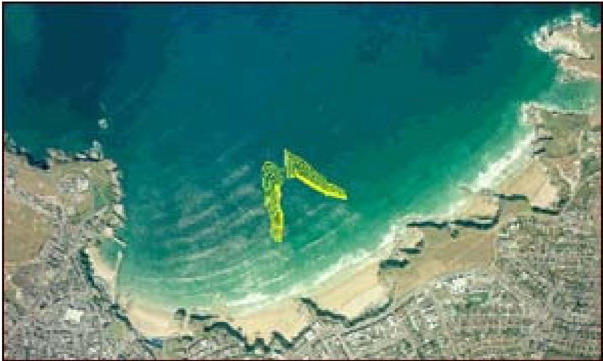
Figure 1. Newquay Artificial Surfing Reef

The Newquay Artificial Reef Company (NARC) is proposing to construct an artificial surfing reef on the seabed approximately 300m offshore of Tolcarne Beach, Newquay, situated on the north Cornish coast in the south-west of England. A feasibility study (ASR LTD, 2002) produced a design for a double arm reef generating world-class surfing waves with 200m long rides. It also identified a series of construction options for the reef's core using sand, rock and tyres.