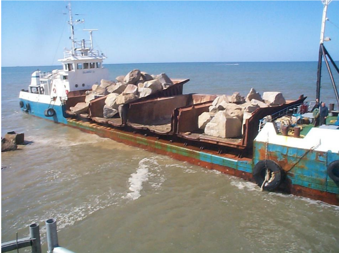
Figure 2: Rock Barge during Construction of Coastal Defence Structure at West Bay, SW England