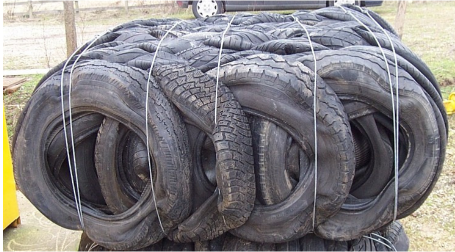
Figure 3. Tyre Bale